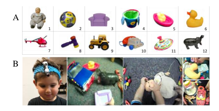
Figure 1: (A) Stimuli set. (B) Experimental setup (left to right) infant wearing a Looxcie camera, infant ego-centric views from camera during toyplay.

Parents and their infants were invited to play in a naturalistic setting for a duration of approximately 10 minutes. Parents and infants both sat on a carpeted floor in a playroom environment. To create an unstructured environment, a random assortment of 33 toys were randomly distributed on the floor (see Figure 1). The toy objects' themes were not related in any particular way; thus, any selection and exploration of objects emerged naturally from infant and parent behaviors. The same toys were used in each session. The instructions were to play freely as they normally would at home.