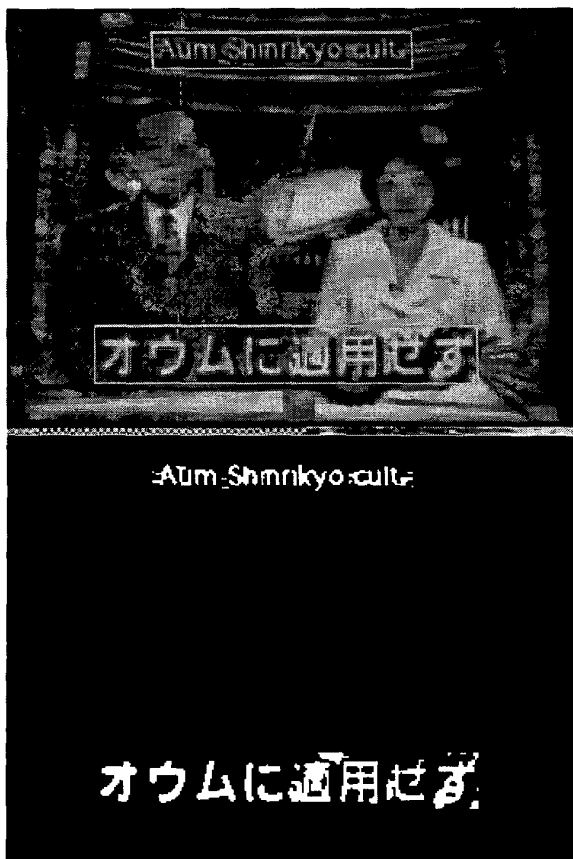
Figure 2. Segmentation Results